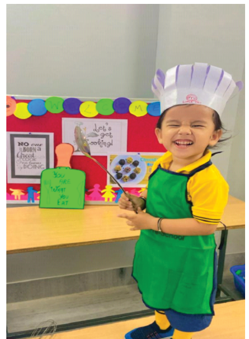
PUNJABI PARA BRANCH