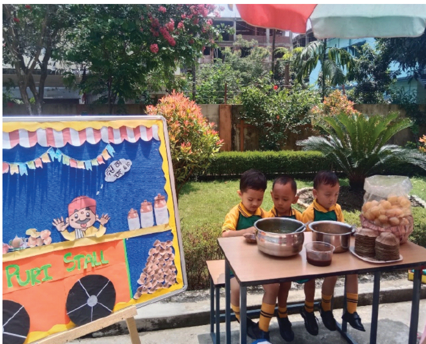
SALBARI PARA BRANCH