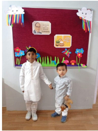
PUNJABI PARA BRANCH