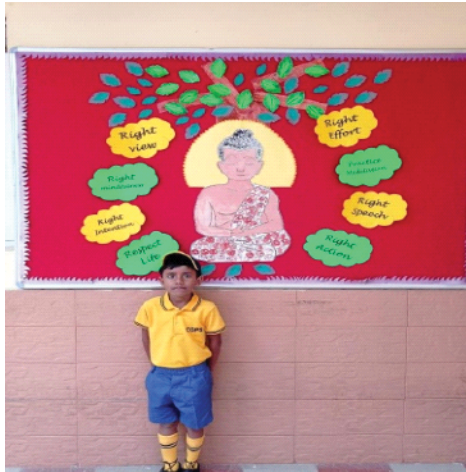
PUNJABI PARA BRANCH